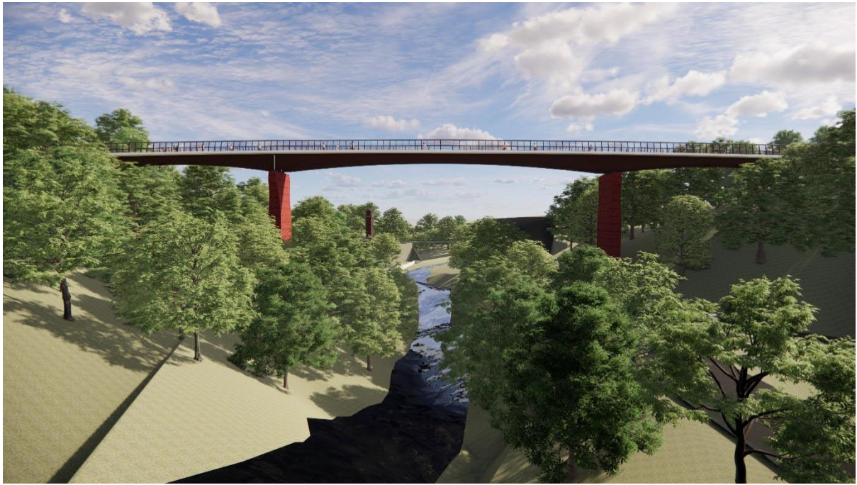
Figure 11- View of west elevation from along River Medlock.