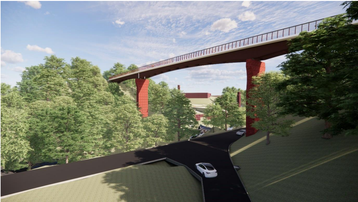
Figure 7- View from the south west along Waggon Road