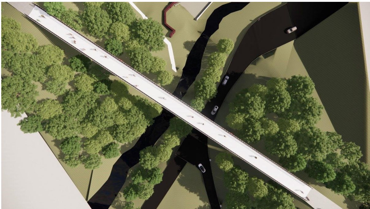
Figure 4- Plan view of bridge over the Medlock Valley