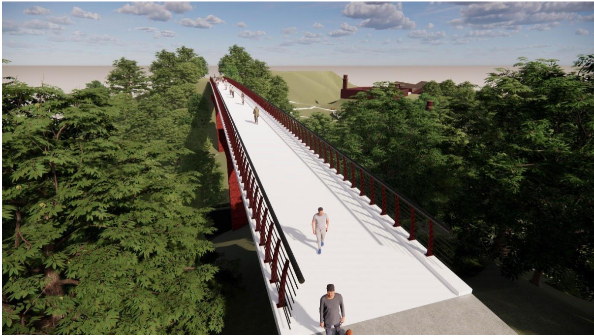
Figure 3- View along bridge deck from the south end