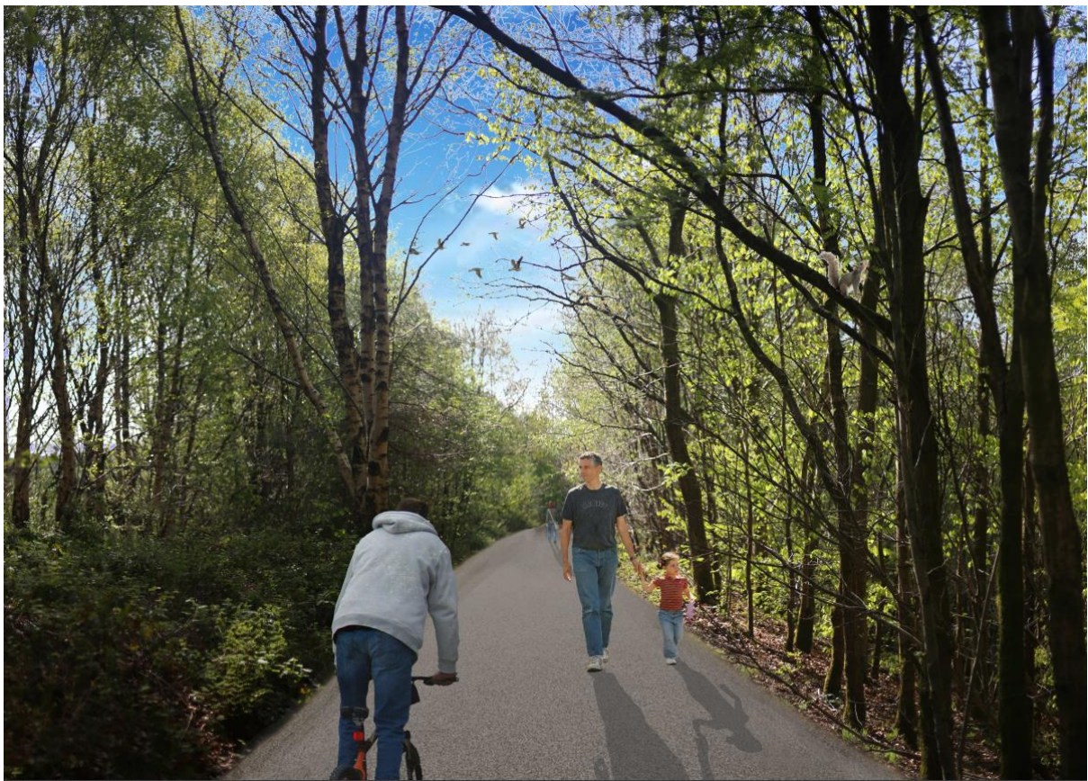
Figure 12- View along the upgraded footpath.