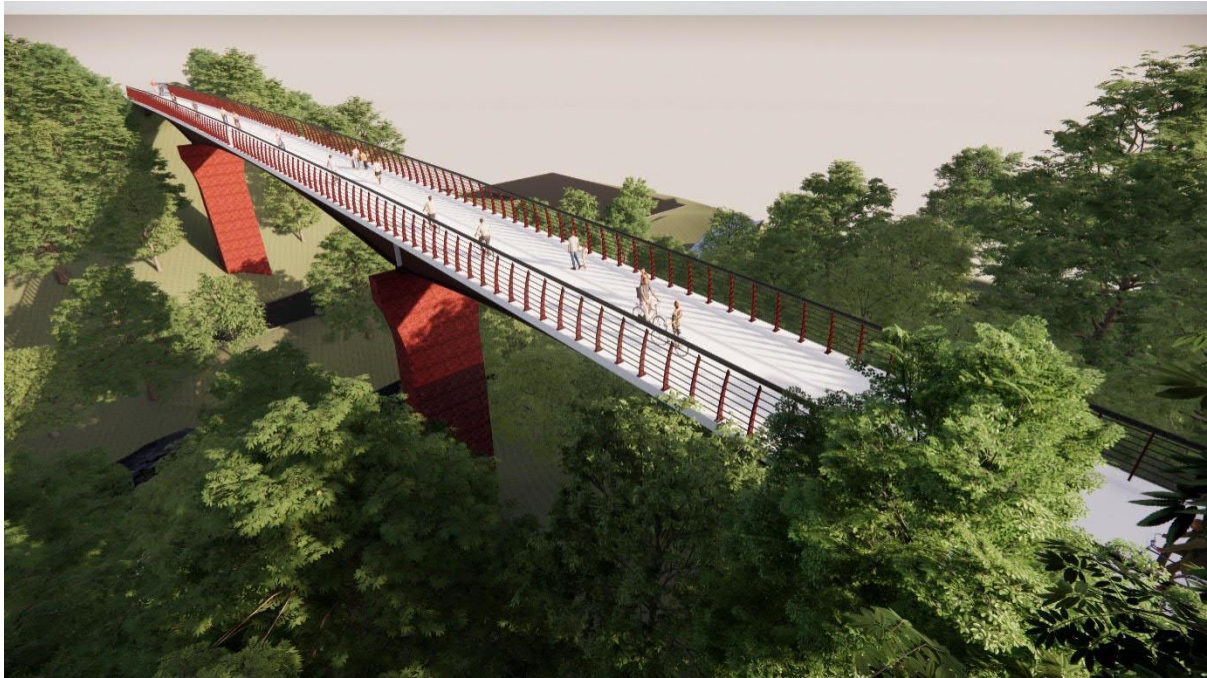
Figure 9- View of deck from north east