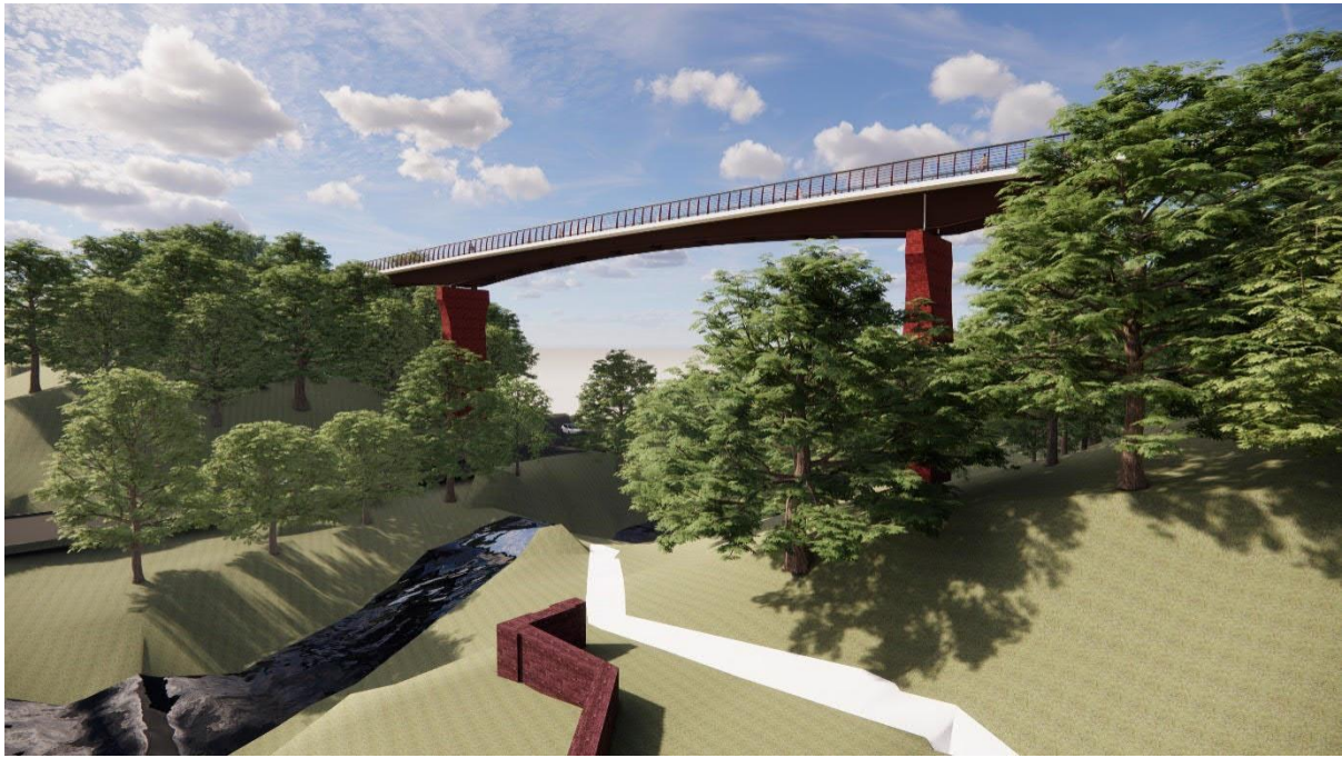
Figure 5- View from the north east