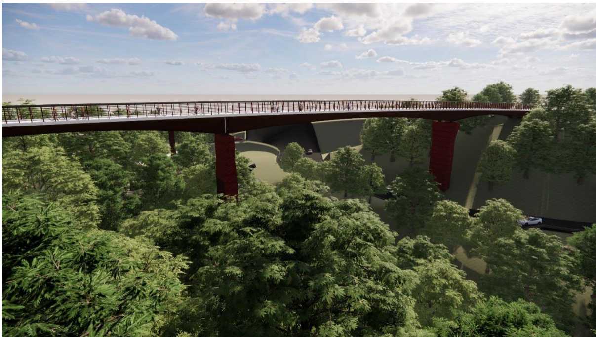
Figure 6- View from the north west