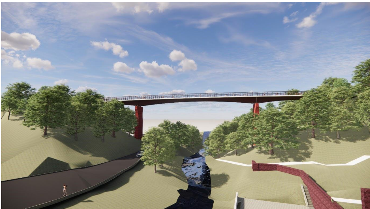
Figure 10-View of east elevation along River Medlock